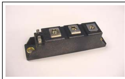
QIC0212003 Dual IGBT Module Common Emitter 120 Amperes / 250 Volts